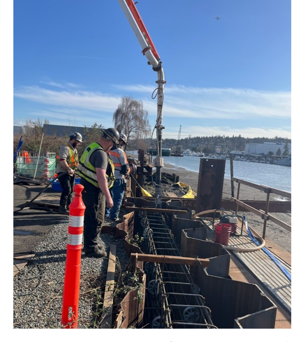
Filling the space between the original and new SMA 9 bulkhead wall system (sheet pile wall) with concrete (Geosyntec Consultants, week of March 3, 2025).