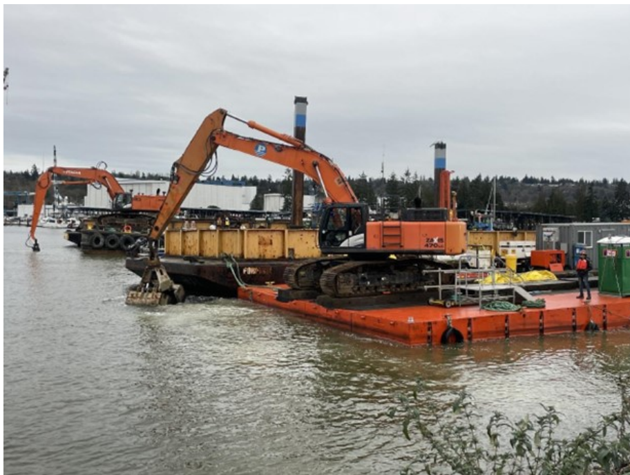
Two dredges placing backfill in SMA 6 (Photo credit: Geosyntec, week of February 17, 2025).