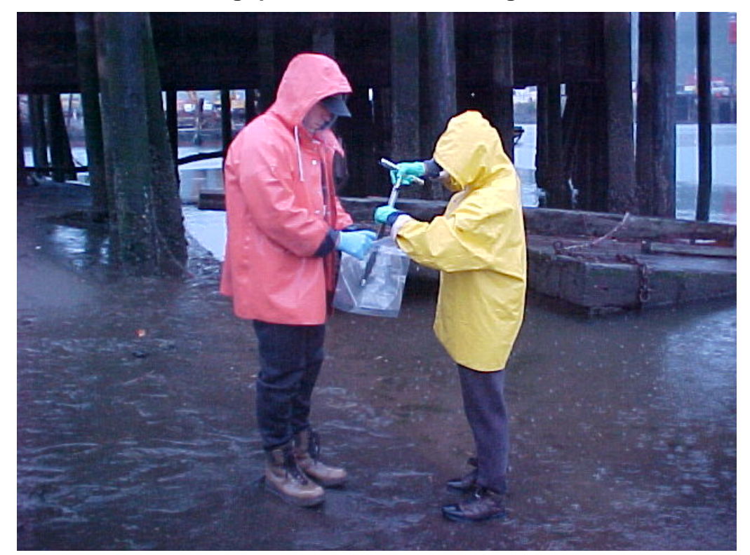
Photo 17. Collecting sediment cores for interstitial salinity and percent fines measurements at beach 7, August 9, 2003.