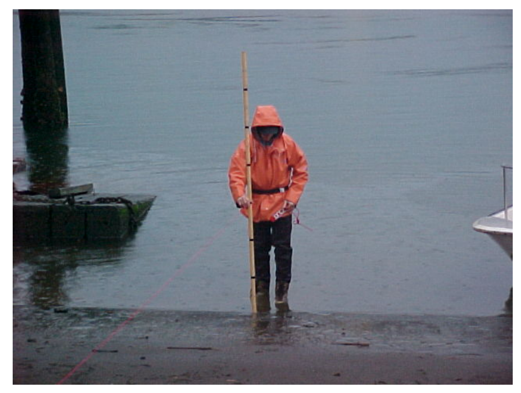
Photo 14. Measuring the elevation at the top of the sample area at beach 7, August 9, 2003.