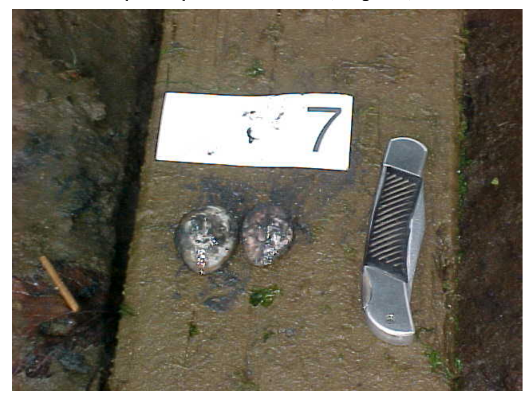
Photo 11. Clams (macoma spp.) collected at quadrat 7 on beach 8, August, 8, 2003.

Intertidal clam survey data report September 26, 2003 Page 9