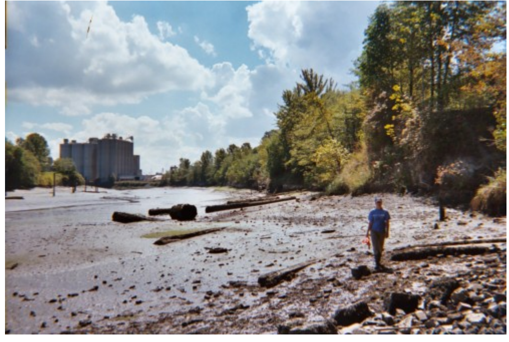
Photo 25. Setting baseline at beach 2a (Kellogg Island mainland), August 12, 2003.