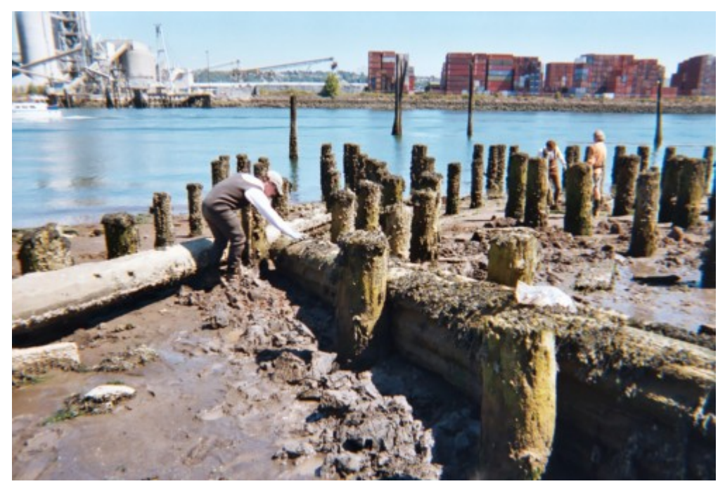
Photo 27. Harvesting clams for CPUE survey at beach 1a (T105), August 13, 2003.