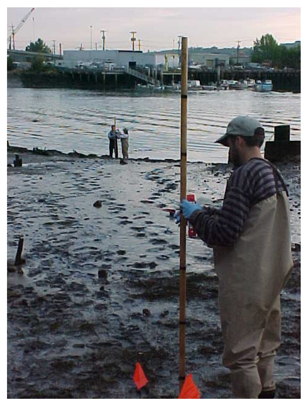
Photo 7. Measuring the elevation at the top of the sample area at beach 8, August 8, 2003.