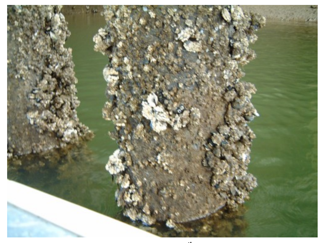
Photo 3. Mussels on pilings of the 16<sup>th</sup> Avenue Bridge (RM 3.3). Photo taken during initial reconnaissance survey, July 16, 2003.