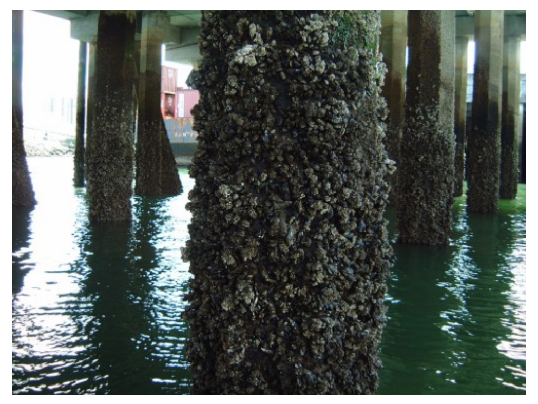
Photo 1. Mussels on pilings of cement plant at RM 1.5 upstream of Kellogg Is. Photo taken during initial reconnaissance survey, July 16, 2003.